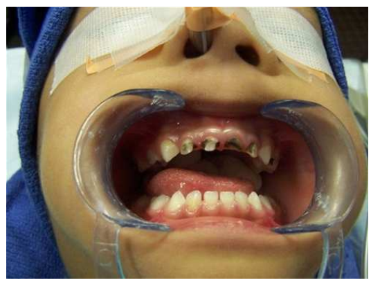
Figure 30. Another angle..