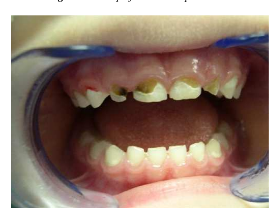
Figure 33. Another view