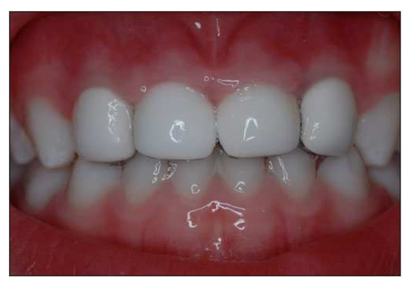
Figure 45. 9 months postoperatively