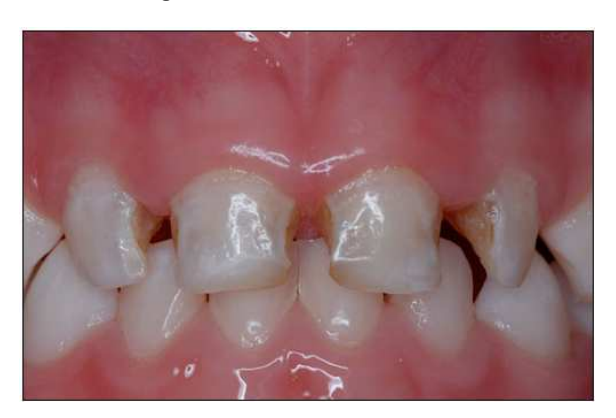
Figure 40. 3-1/2 - year - old boy with early childhood caries of incisors.