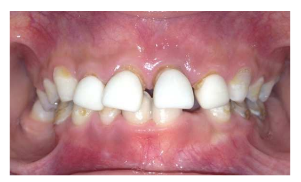
Figure 11. After 6 months photograph of the boy