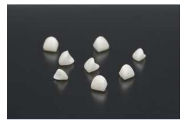
Figure 39. NuSmile Pediatric Crowns