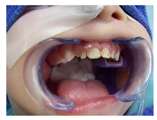
Figure 23. Different view, same child.