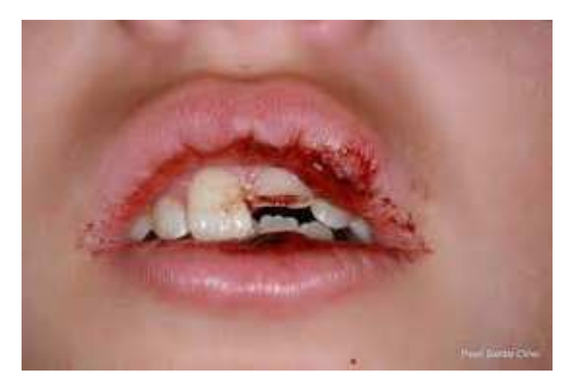
Figure 2. Child tooth trauma