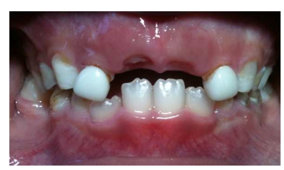
Figure 13. After one and a half year photograph of the boy