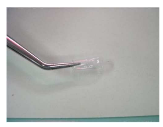
Figure 20. Here is what the crown formers