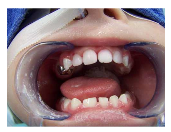
Figure 28. Strip crowns placed