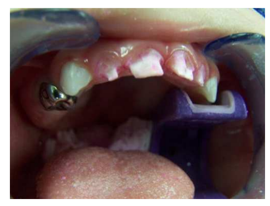
Figure 26. Other view