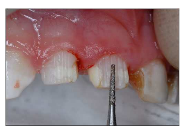
Figure 43. "Minaturization" (tooth preparation) with high-speed water-cooled diamond bur