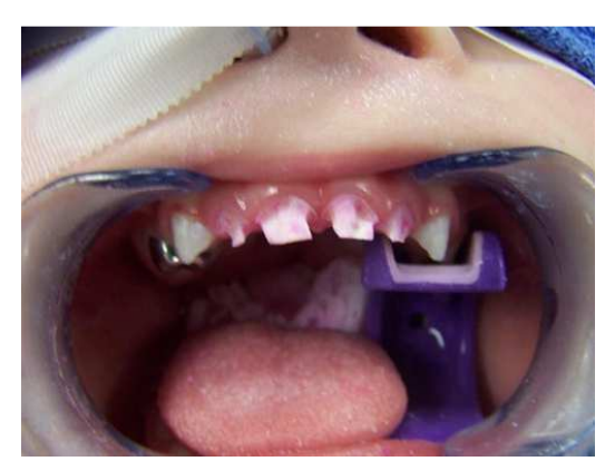
Figure 25. Decay removed. Note the caries detector shows some slight stain. If I had removed any more tooth structure i would have been forced to do pulpotomies.