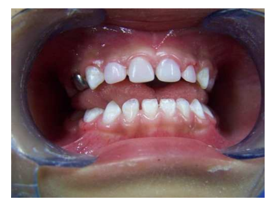
Figure 31. Granted the problems are more cosmetic