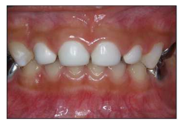
Figure 47. Patient after restoration with NuSmile(r) Crowns.