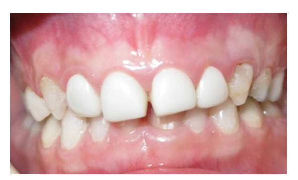
Figure 12. After 6 months photograph of the girl