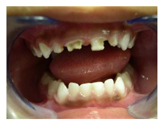
Figure 19. This is with the decay removed