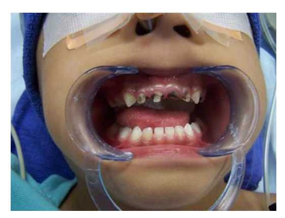
Figure 29. Another 2 year old child with bottle mouth, or "soft teeth", or "teeth with no enamel"