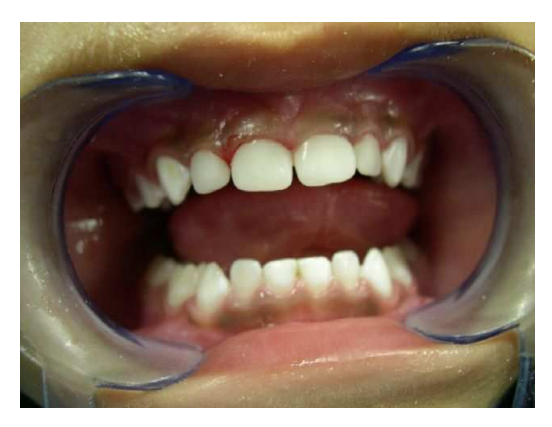
Figure 21. Here is the finished case. The teeth were pretty crwoded so I didnt get quite the angulation