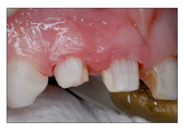
Figure 44. Final preparation completed