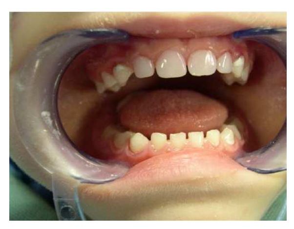
Figure 37. Finished view