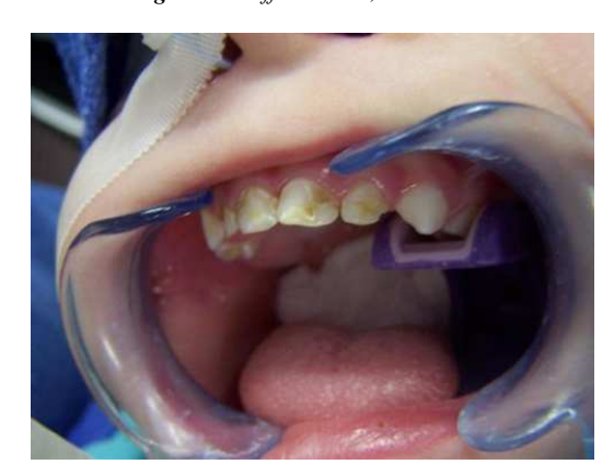
Figure 24. Other side