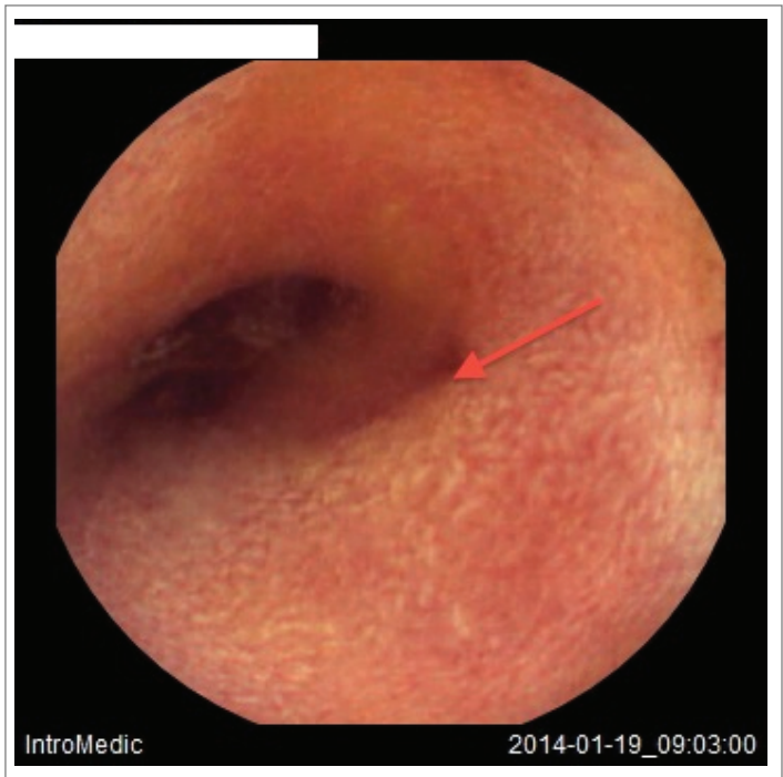
Figure 1: Small opening with minimal bleeding (arrow) and narrowing of the main lumen.