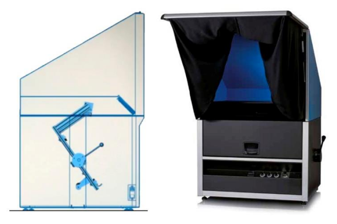
Figure 1: The Byko-spectra effect multi-directional light booth (BYK-Gardner).

real samples inside the physical lightbooth to improve the visualization of 3D objects covered by effect coatings.