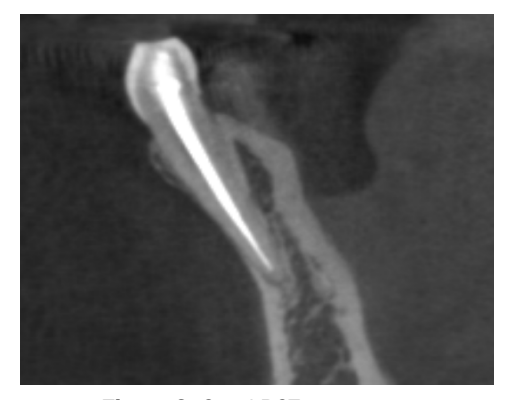
Figure 2. Good RCT treatment.

Of the 504 CBCTs examined in this study, only 31 maxillary and mandibular teeth (20.61%) of root fillings had high technical quality. Different surveys have demonstrated that general practitioners, even the recently qualified, do not follow guidelines taught during their basic education (Helminen et al., Hill and Rubel) [10-13]. Undoubtedly, this needs to be improved. However, it is already known from an investigation of the frequency and distribution of root-filled teeth and apical periodontitis in a Greek population that the prevalence of apical periodontitis associated with the root-filled teeth was 60% (Georgopoulou et al.). It is well established that the presence of apical periodontitis in root-filled teeth is often associated with inadequate root fillings.