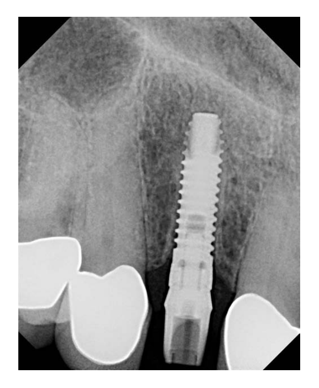
Fig.11:Stock abutment PA to confirm seating