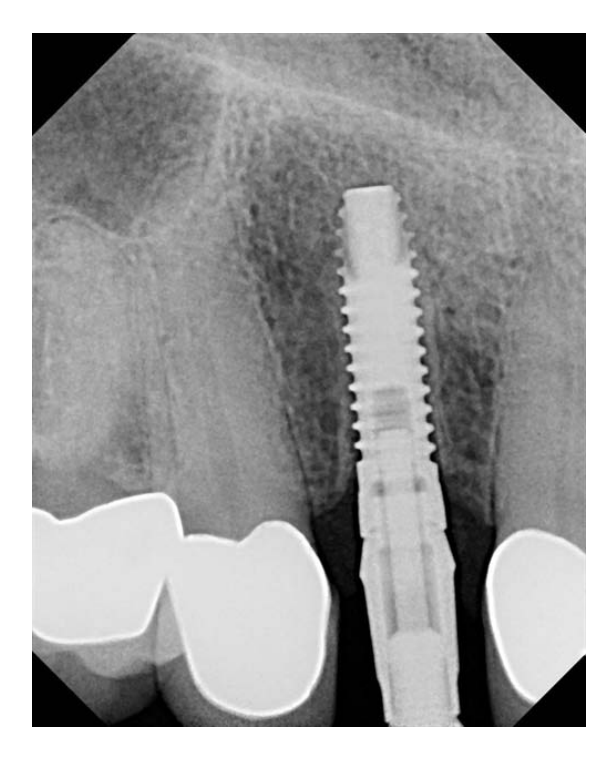
Fig.9: PA to confirm seating