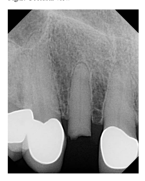
Fig.3: Initial PA