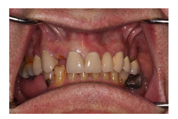
Fig,1. Fractured lateral