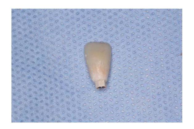
Fig.6:Peek prefab abutment with stock temp crown