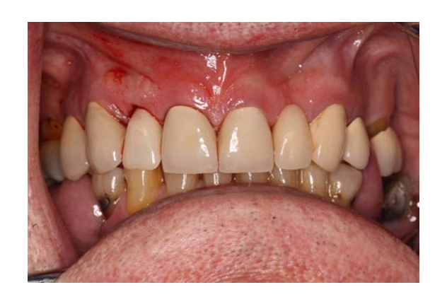
Fig.7:Temp in mouth the day of surgery