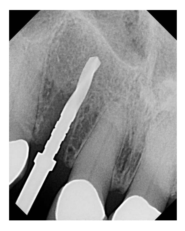
Fig.4:PA post extraction with 15mm 2.0 drill