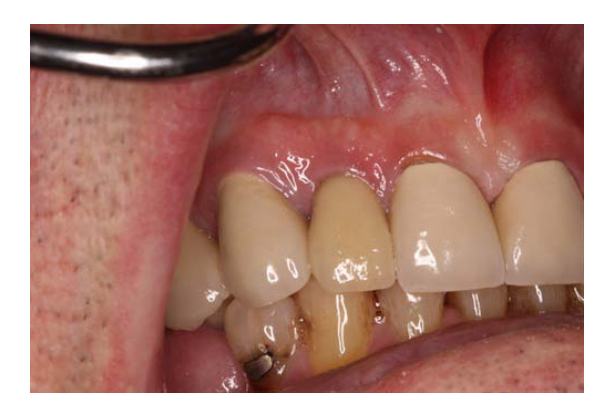
Fig.14: Final crown the day of cementing