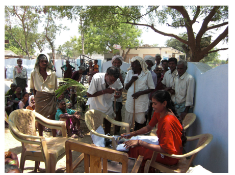
Payments being disbursed to pensioners in Warangal district of Andhra Pradesh

reflected the growing importance of good governance. Once again, in many states good governance was able to overcome the incumbency factor. In other states bad policies and dogma led to failure. On the global front, President Obama's bold speech in Cairo could pave the way for greater peace on earth in the long run. This second issue of 2009 reflects some optimism in the ICTD world. We carry articles about a number of successful projects from many different countries.